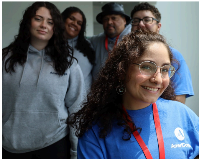
AmeriCorps service members from Summer 2023